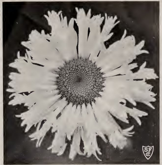
SHASTA DAISY MARIAN COLLIER. Dwarf everblooming sort with gracefully fringed flowers for cutting. Hardy border plant. 25c each.